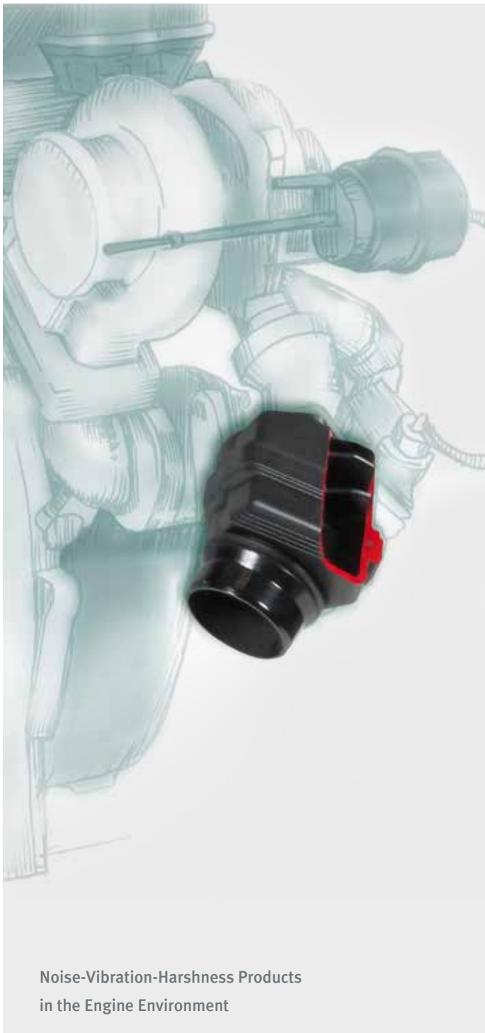
Noise-Vibration-Harshness Products in the Engine Environment

Isolation and attenuation of noise and vibration under the hood using special materials and combinations over a frequency range from 20 to 20,000 Hz is now realized in diverse Woco products.